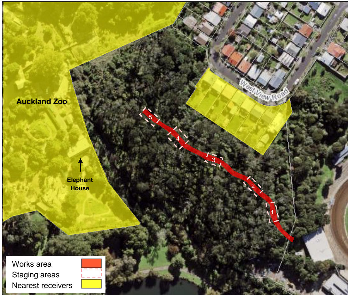
Figure B.1: The construction site and nearest receivers

The works area (red) and nearest noise and vibration receivers (yellow) are illustrated in Figure B.1.