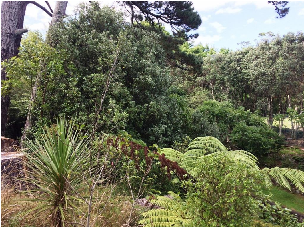
Plate 3: Mature karo with māhoe and punga in PAP 3. The grassed floodplain is visible in the bottom-right side of the photograph. 7 February 2018.