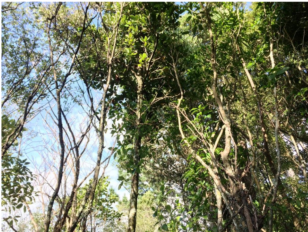
Plate 5: Young taraire (centre) grows with māhoe and kōhūhū in Area 4. 7 February 2018.

This area warrants protection given its floristic diversity, its potential for acting as a source of seeds post-felling, and for its contribution to maintaining slope stability.