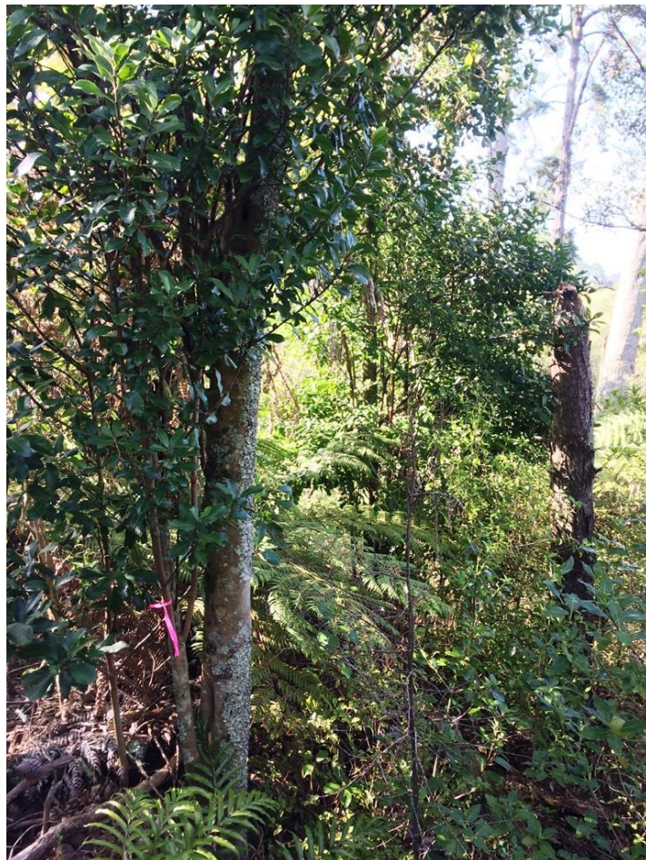
Plate 7: Semi-mature pigeonwood with pink flagging tape. 7 February 2018.