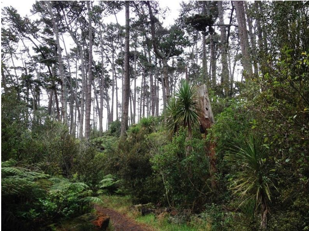
Plate 1: View of indigenous understorey from the main walking track. 25 May 2014.