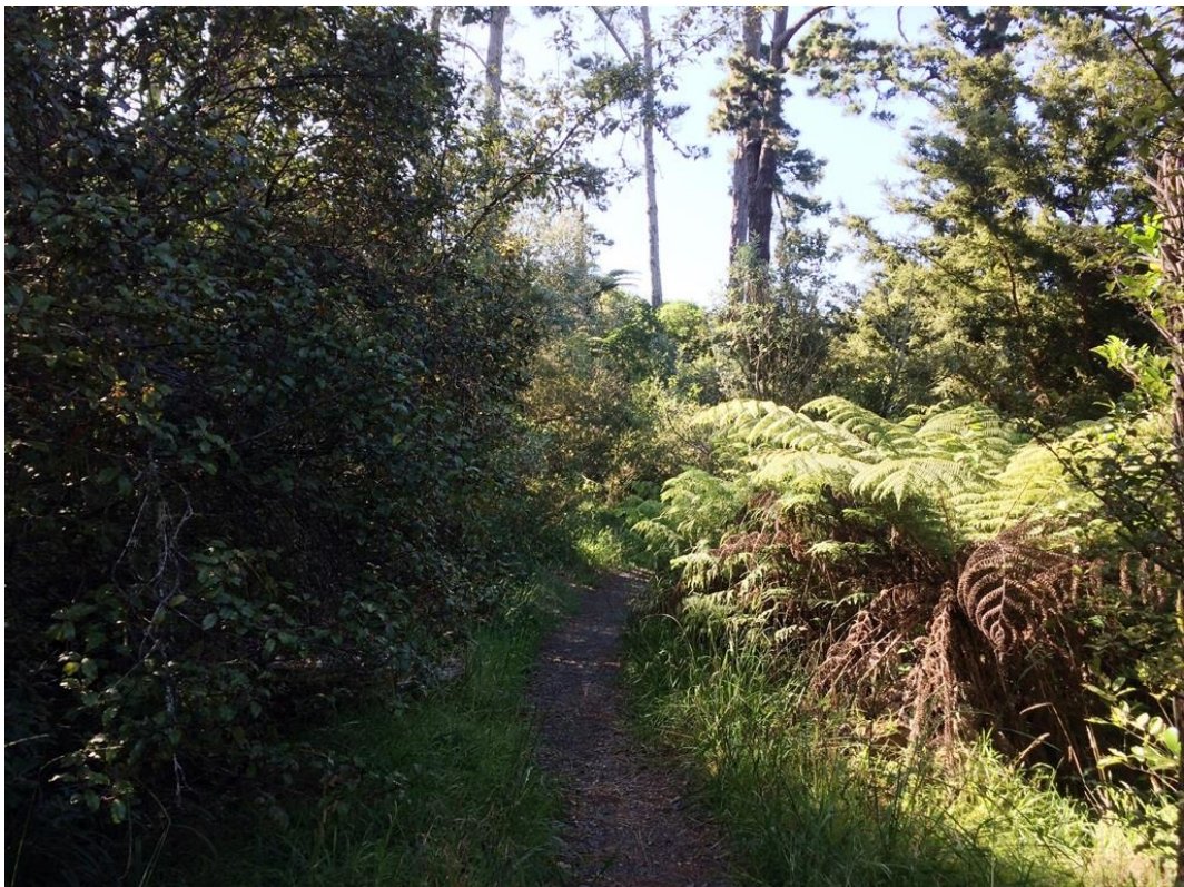
Plate 4: View looking eastwards along the walking track, which bisects good quality vegetation in PAP 3. 7 February 2018.