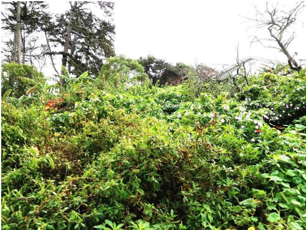
Plate 6: Large infestation of shrub balsam, inkweed and garden nasturtium on the northeastern boundary of the site. 30 May 2014.