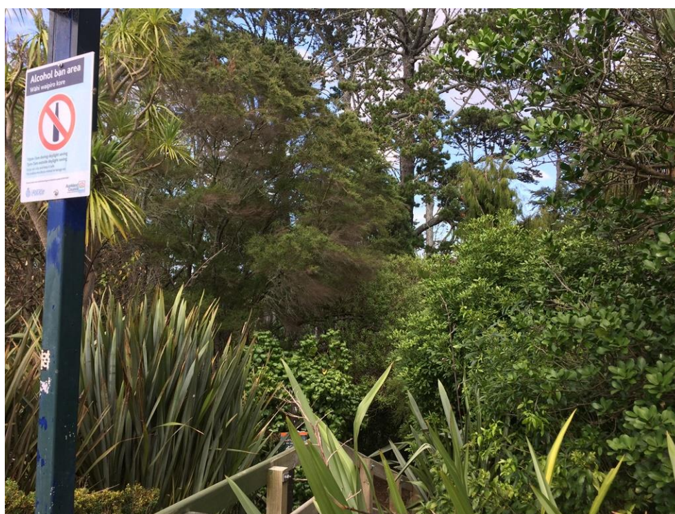
Plate 1: Mature karaka, kānuka, māhoe and tī kōuka in PAP 1. 7 February 2018.

PAP 1 occurs near the track entrance at West View Road and comprises a mixture of good quality planted and naturally occurring vegetation, including mature specimens of māhoe ( Melicytus ramiflorus ), karaka ( Corynocarpus laevigatus ), rimu ( Dacrydium cupressenum ), kānuka ( Kunzea robusta ), pōhutukawa ( Metrosideros excelsa ), and ngaio ( Myoporum laetum ) (Plate 1). Sub-canopy species include houpara ( Pseudopanax lessonii ), karamū ( Coprosma robusta ), and harakeke ( Phormium tenax ). Given that this area is upslope of all mature pines, it should be relatively easy to avoid during the felling process.