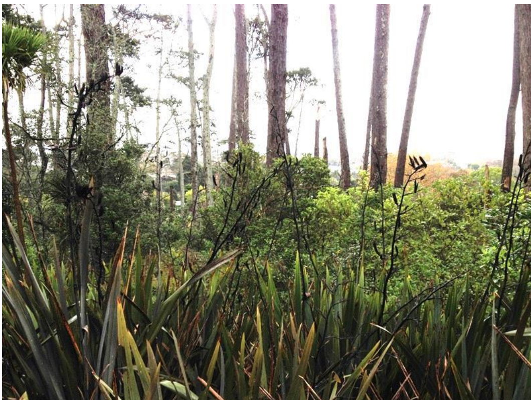
Plate 4: View across the northern end of the forest where mature pines are less numerous than the central region. 30 May 2014.