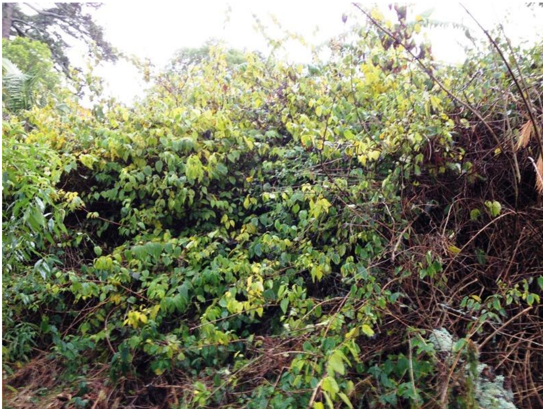
Plate 7: Large infestation of Himalayan honeysuckle on the northeastern boundary of the site. 30 May 2014.