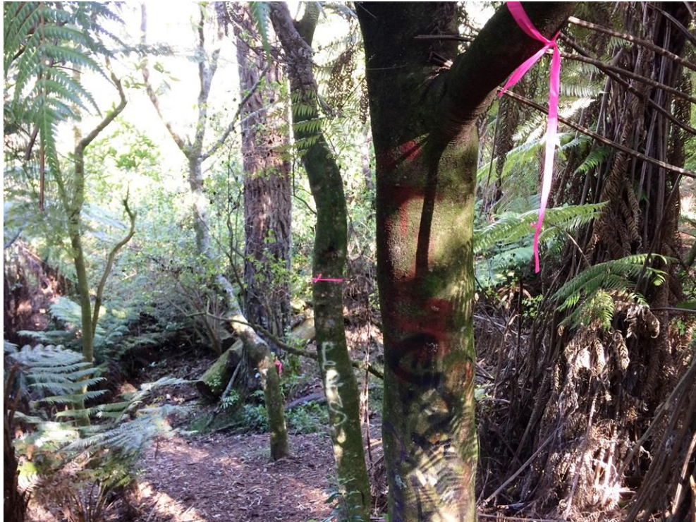
Plate 6: Three mature karo with pink flagging tape. 7 February 2018.