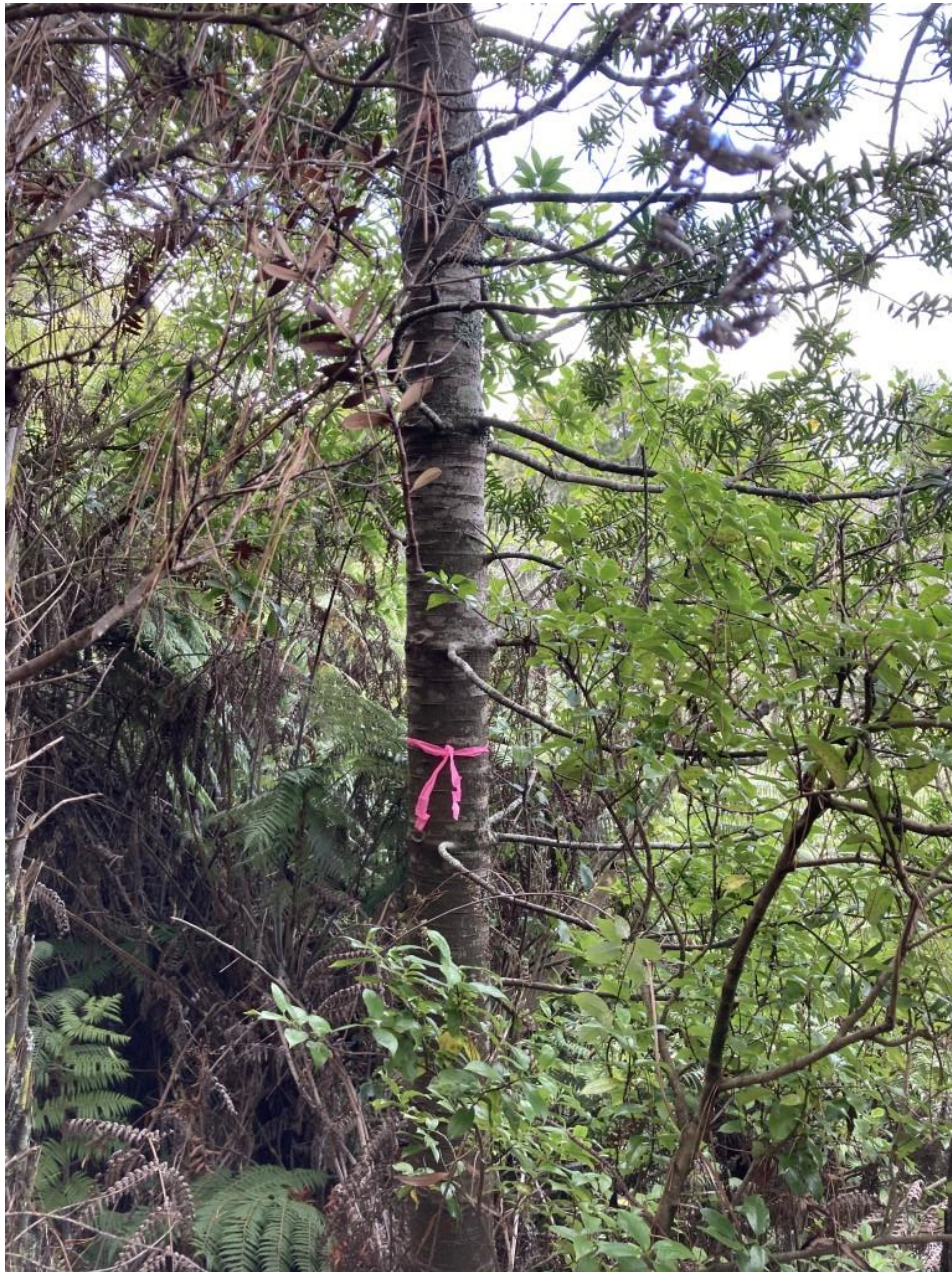
Plate 5: Planted kauri that will not be affected by the proposed access track. 18 March 2021.