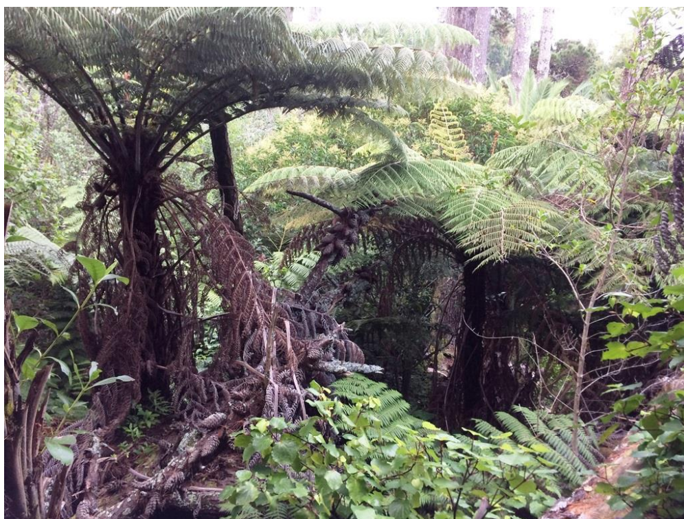
Plate 2: Ponga canopy with kawakawa in the understorey forms a good buffer for the intermittent stream in PAP 2. 7 February 2018.

The northern part of PAP 3 comprises established indigenous scrub located on a steep toe slope adjacent to the floodplain. Plant species include mature karo, māhoe, ponga, and karamū (Plate 3). The middle section of Area 3 comprises a relatively diverse, mature area of indigenous vegetation that bounds either side of the walking track adjacent to the floodplain of Motions Creek. It is characterised by karaka, māhoe, māpou ( Myrsine australis ), mature tī kōuka (cabbage tree; Cordyline australis ), karamū, ponga, karo, and tōtara ( Podocarpus tōtara ) (Plate 4). Further to towards the southern-most boundary of the forest park entrance, the vegetation comprises an area of established indigenous scrub situated on moderate to steep slopes. The vegetation is characterised by mature karo, māhoe, ponga, tī kōuka, and one semi-mature pūriri ( Vitex lucens ). This area warrants protection give its floristic diversity, its potential for acting as a source of seeds post-felling, and also for its contribution to maintaining slope stability.