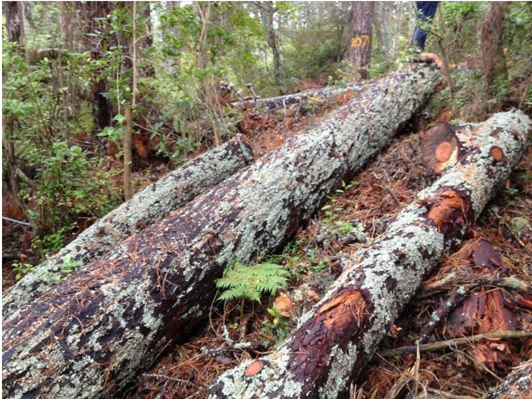
Plate 3: Directionally felled mature pine left to break down in the central part of the forest. 5 May 2014.