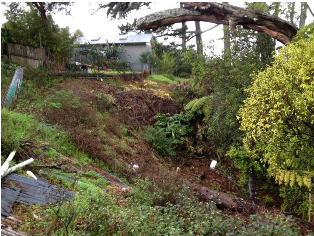
Plate 2: Northeastern boundary of the forest where steep banks are covered in exotic plant species and household rubbish. 25 May 2014.