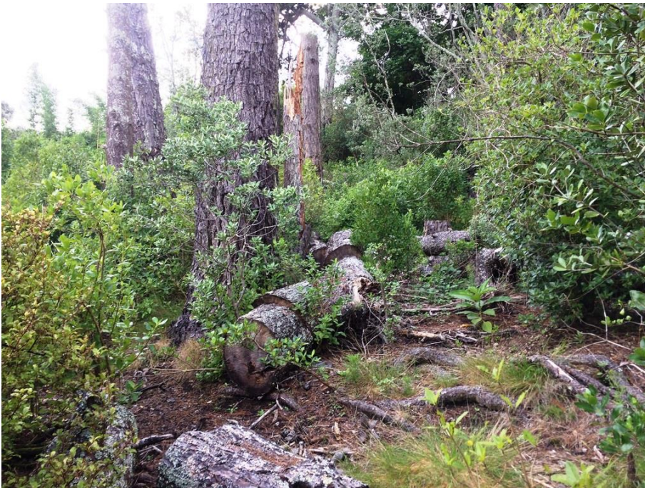
Woody debris in the understorey of the Western Springs pine block.