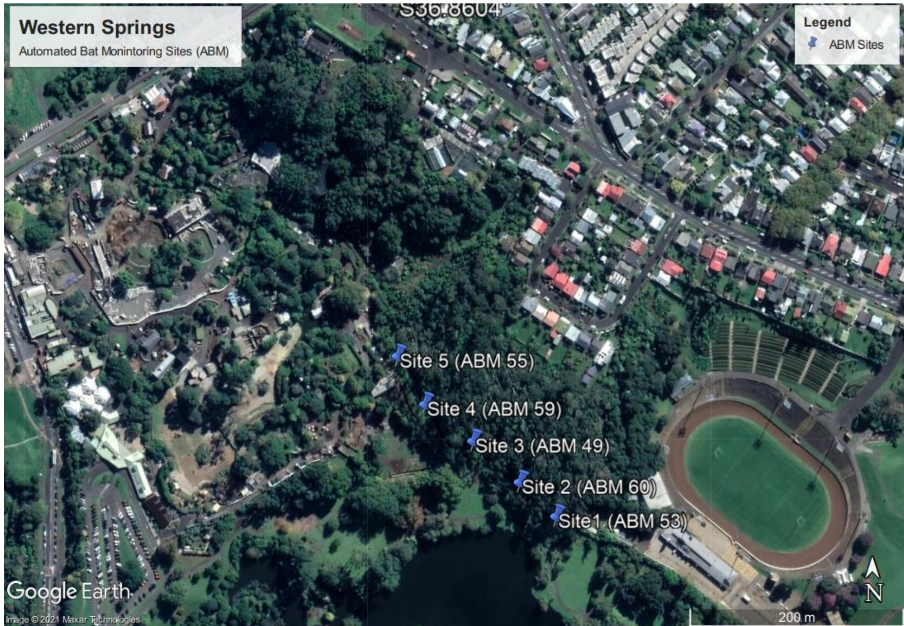
Figure 1: Google Earth map of Automated Bat Monitoring Sites 1-5 at Western Springs.